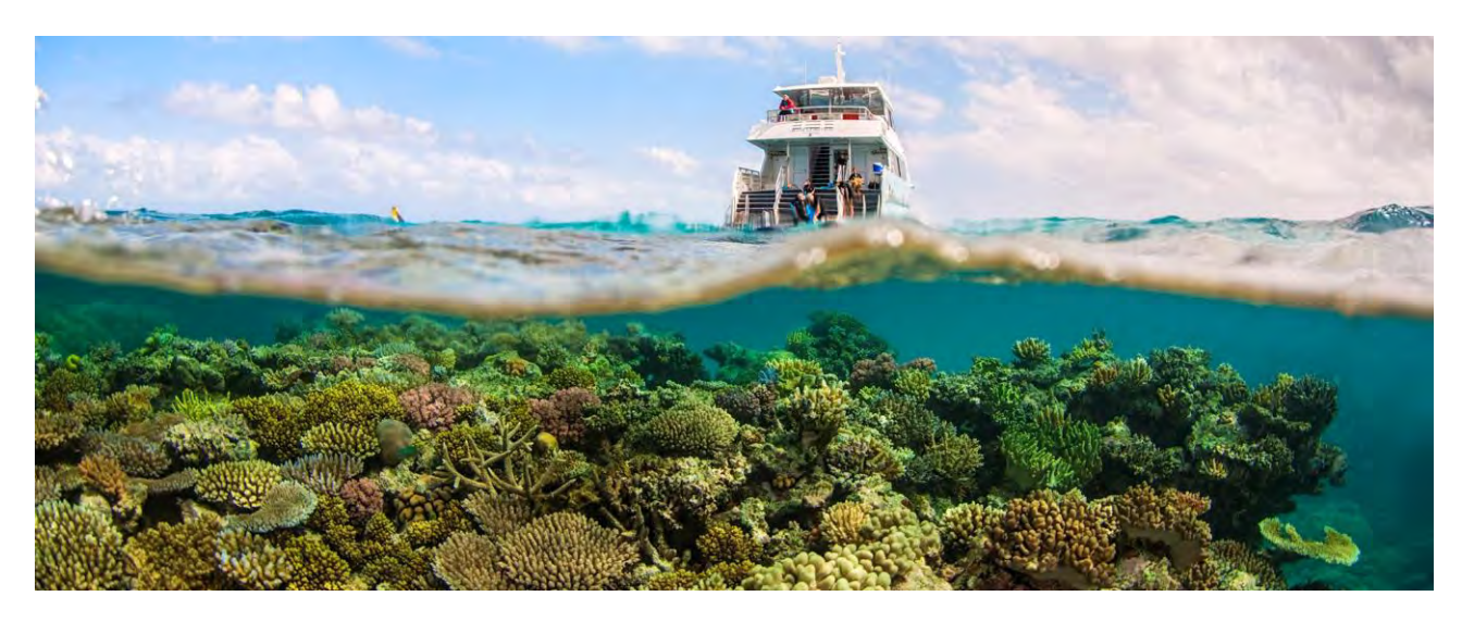
TUESDAY, 17 AUGUST