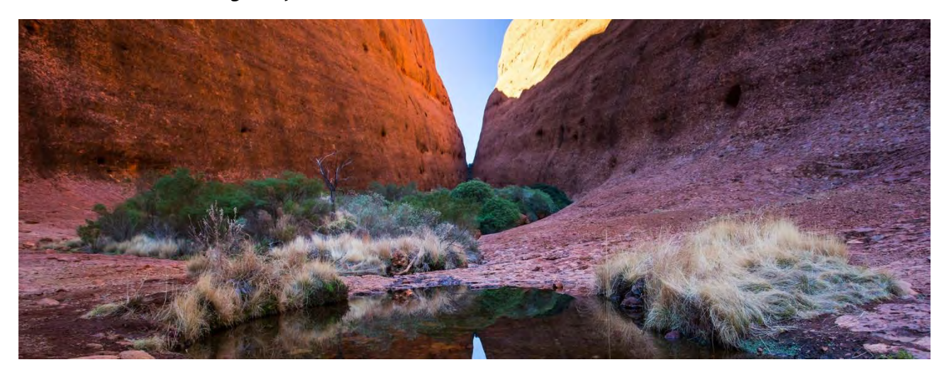
FRIDAY, 13 AUGUST

ACCOMMODATION: Kings Canyon Resort, or similar.