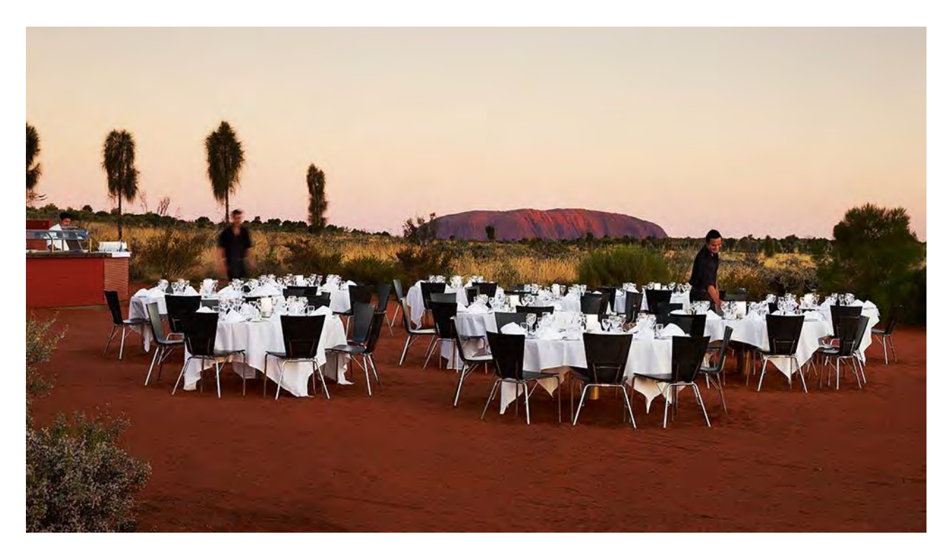
SUNDAY, 15 AUGUST Uluru - Cairns (B D)

We transfer to airport for our flight to Cairns. On arrival, we drive north to the beach resort of Palm Cove. In the evening we get together for dinner at the Reef House Restaurant, where we will enjoy a meal made from seasonal ingredients as we overlook the crystal-clear water of the Coral Sea.