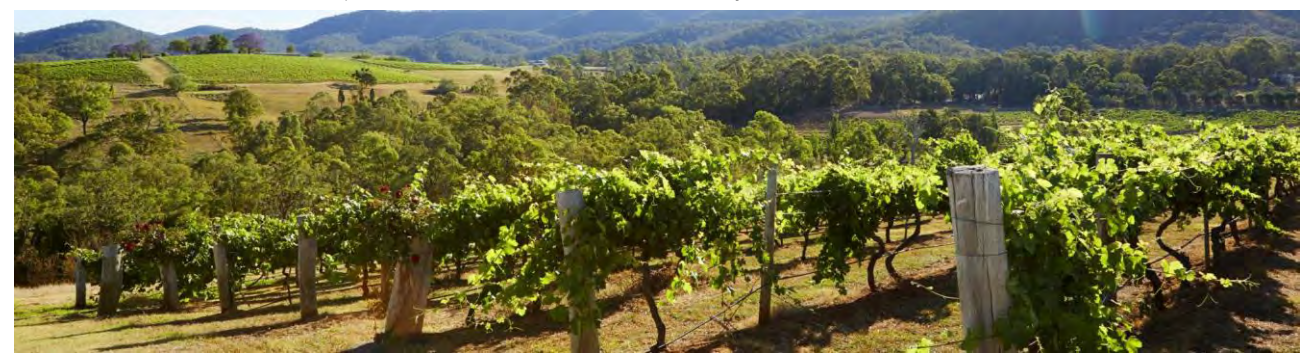
SUNDAY, 8 AUGUST

ACCOMMODATION: Lillianfels Blue Mountains Resort and Spa, Katoomba, or similar.