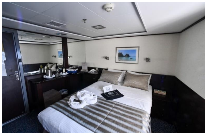
Category C Cabin (single occupancy)