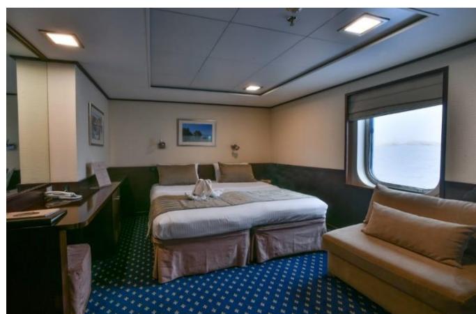
Category P Cabin