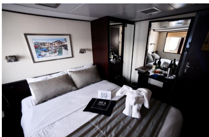
Category B Cabin (single occupancy)