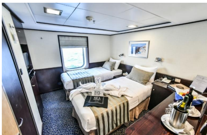
Category A Cabin

The tour cost is based on a minimum of 16, maximum of 20 participants. In the unlikely event that this number of participants is not reached, Gippsland Travel reserve the right to cancel the tour. In this instance only, a full refund of all deposits paid will be refunded.