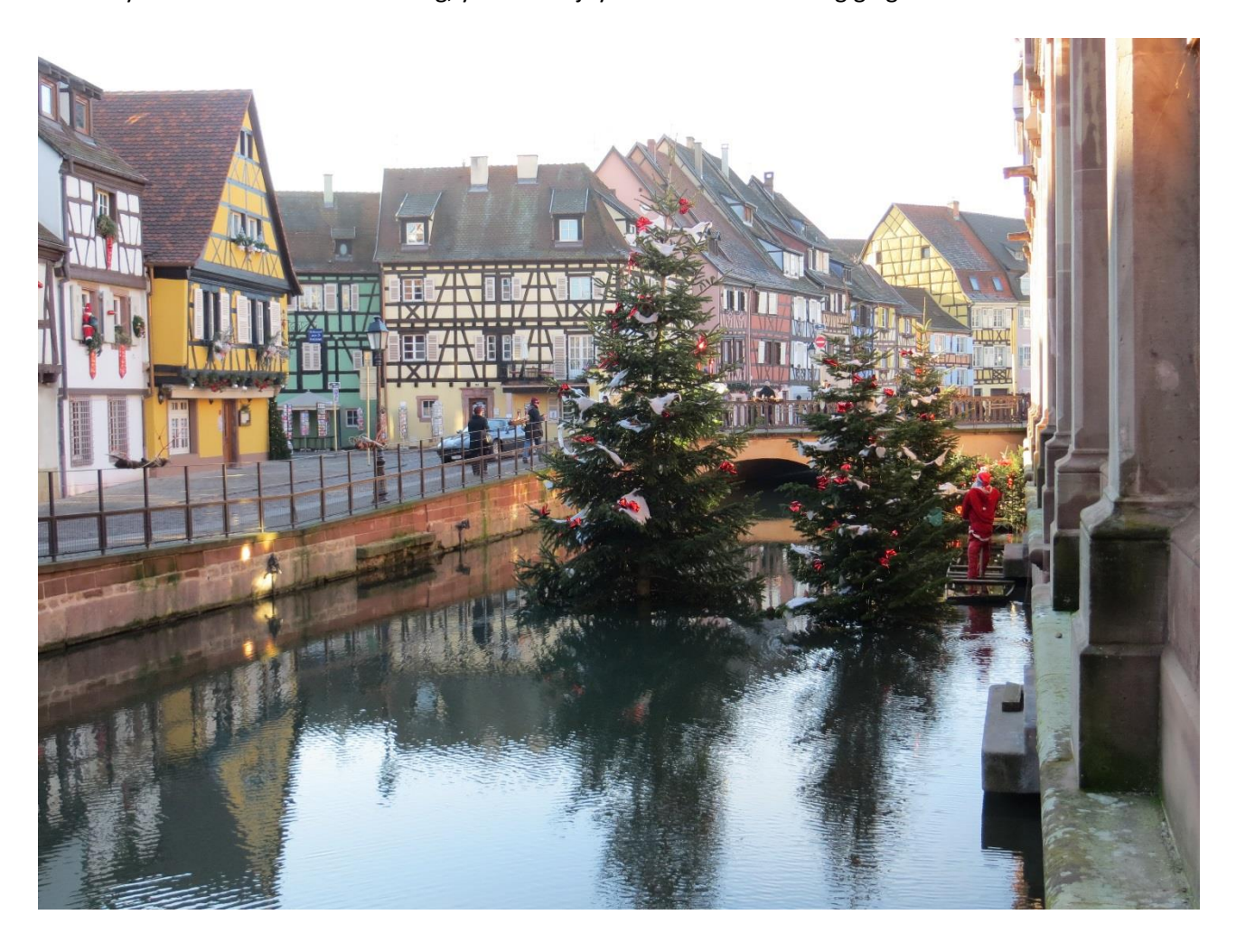
Friday, 16 December Rothenburg - Strasbourg (BD)

During the Middle Ages, Nuremberg was the preferred residence of German emperors. We shall visit Kaiserburg Castle, which rises high above the city and has housed every emperor of the Holy Roman Empire. Your walking tour continues along cobblestone streets to one of the most famous examples of 14th-century German ironwork, the Schöner Brunnen (Beautiful Fountain) in Hauptmarkt (Market Square). Finish the day shopping for one-of-a-kind gifts at the festive Christkindlesmarkt, the largest and oldest Christmas Market in Germany. In this fine Medieval setting, you can enjoy authentic Nuremberg gingerbread and bratwurst.