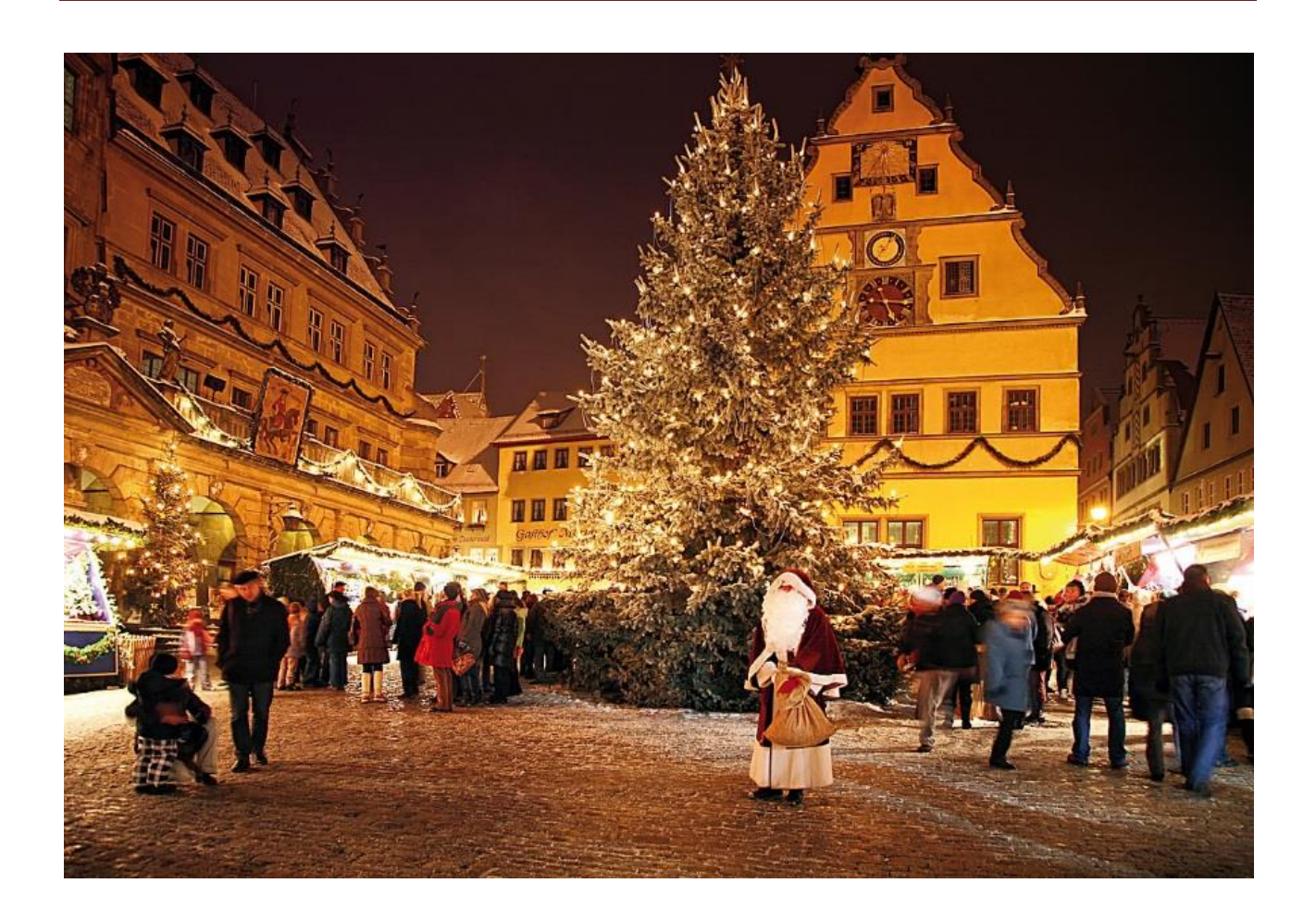
Tuesday 13, Wednesday 14, Thursday 15 December